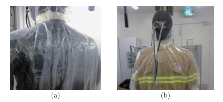
Fig. 2: Thermal manikin clothed with: (a) cooling vest and PVC membrane (A), and (b) firefighter's ensemble and PVC membrane (B)

The cooling vest A (Table 2) was pre-wetted prior to testing, by immersing into warm distilled water for 2 minutes and then placed on a towel and rinsed. An external impermeable PVC membrane was used to cover the manikin, sealed with adhesive tape at the wrist, neck and at the top of the thigh.