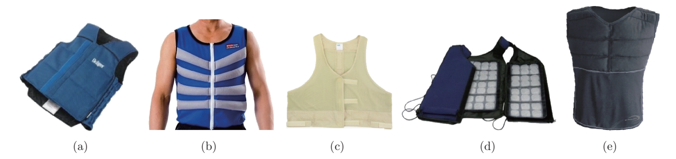
Fig. 1: Systems for cooling firefighters: (a) Drager, (b) Arctic Heat, (c) Cool Comfort, (d) Flexi Ice Vest [7, 8, 9, 10] and (e) Cooling vest [11]

Each system differs in performance over time and functionality. The focus of this paper is on the passive cooling system using a cooling vest. The passive system, in the form of a nonwoven fleece material, was distributed across the surface of a vest on the upper chest and back. A nonwoven fleece with hydro-crystals swells on contact with cold water and, in turn, cools the wearer or keeps their skin temperature at normal levels. The lower part of the vest was made of a polyester air-netted material. We hypothesize that this cooling vest can decrease the thermal insulation of firefighters' clothing. The cooling vest may be used while performing high intensity work, such as firefighting, and can be used as standalone product or in combination with other breathable or non-breathable clothing [11]. Furthermore, it may be used as a pre-cooling system prior to activity, as inter-cooling during activity and as post- cooling after high intensity work.