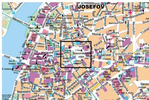
Fig.1 布拉格旧城区中心地图 Map of the Old Town in the center of Prague

斯坦 (Albert Einstein) 和他的大学同僚乔治·皮克 (Georg Pick), 而皮克是教授爱因斯坦张量微积分的数学家之一。上述科学家在布拉格生活期间, 建立了几个对后世影响深远的数学和物理学理论, 并且从事相关之研究工作。十七世纪初, 开普勒根据第谷·布拉赫的观测结果, 提出行星运动三大定律之第一、第二定律。十九世纪上半叶, 波尔查诺给出了一个既有分形特征, 又不可微分的连续函数, 并且以无限数集 (infinite sets) 为题撰写了《无穷的诡论》(Paradoxes of Infinity, 1851)。1842年, 布拉格理工大学数学教授多普勒在布拉格Ovocný trh(图1)的查理大学, 首次就其创立的效应 (后来称为“多普勒效应”) 发表公开演讲。1911年至1912年, 爱因斯坦在布拉格德国大学 (Prague German University) 担任理论物理学教授, 醉心于广义相对论的研究工作。甚至著名捷克作家卡雷尔·恰佩克 (Karel Capek) 也是在布拉格发明“robot”这个词 (捷克语Robota, 意谓劳役、苦工)。本文后面会简单介绍这些与布拉格息息相关的伟人纪念碑和雕塑。接下来, 本文集中讨论布拉格旧城广场中心的一个著名建筑物, 分析其中有趣的数学问题。