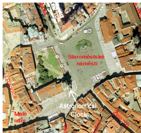
Fig.2. 旧城广场天文钟的位置 Location of the astronomical clock at the Old Town Square (Staroměstské náměstí)

In the center of Old Town in Prague (see Figures 1 and 2), there is an astronomical clock (called “orloj” in the Czech language and horologe in English) — an interesting rarity often visited by many tourists, not only mathematical tourists. We found that there is a surprising connection between this clock and triangular numbers. In this article we take notice of special properties of these numbers that make the regulation of the bellworks more precise.