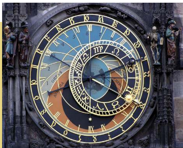
Fig. 4 天文钟的上钟盘

布拉格天文钟设于旧城市政厅一座约六十米高的钟楼内, 而两个大钟盘 (图3) 则镶嵌在钟楼南面的外墙上。六百年来, 天文钟经历过几次大型翻新, 其中一次约在1490年, 由克伦洛夫城 (Ruze) 的钟表工匠简恩 (Jan, 又名哈劳斯大师Master Hanus) 带领进行。天文钟下钟盘的左方特别设置一面纪念碑, 用来表彰这些钟匠们的付出和贡献。