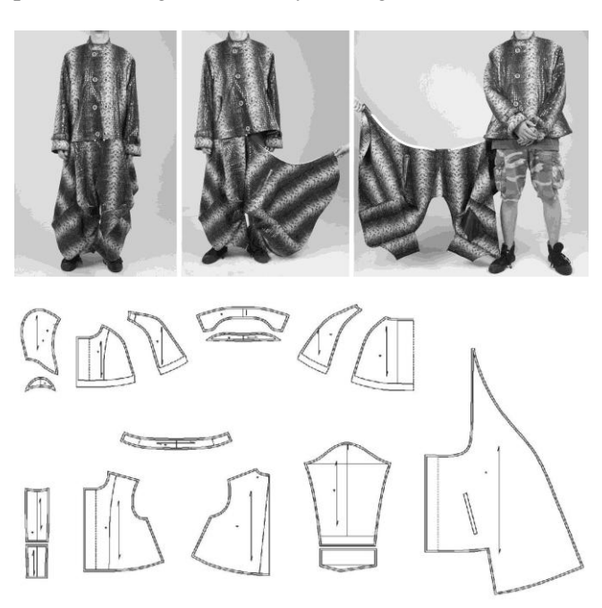
Figure 3 Details and patterns of Case 1

The waist position is separated by zippers, so that it is convenient for the rider to mount and dismount the personal motor vehicle. The entire garment is separated into upper and lower parts from the waist position, and the upper part includes inside and outside components. The inside component is connected with the motor vehicle by zippers. The outside part looks like a mantle, utilizing construction methods such as segmentation, breaking joint, and expansion. The wind coat is designed in a loose and built-up style; the silhouette is straight, like a box or a case. The outside mantle, in an A-shape, facilitates the stretching of the arms, the bending of the body, and the putting-on and taking-off of the garment, with the sleeve covering from shoulder to elbow and the back of the garment covering the entire back rest of the vehicle. Rider and personal motor vehicle are combined together to resist rain. The ease is 30cm, and there is a relative larger ease at the position of armhole and back width. Possessions can be carried in a functional pocket in the side position of the garment panel covering the motor cycle (Figure 3).